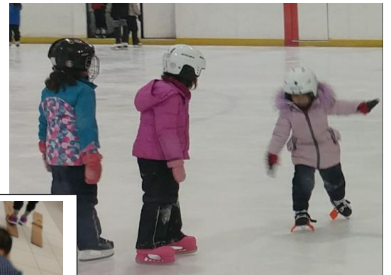
Our youngest learners are staying active this winter!