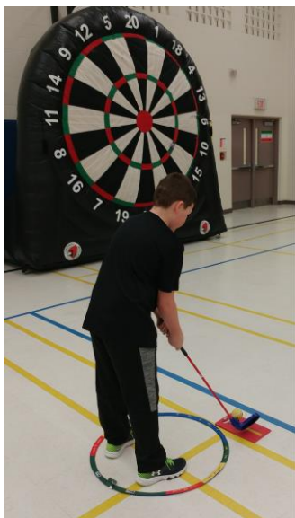
Junior students had fun learning fundamental golf skills with Cardinal Golf Club's indoor golf program.

For more information on dates, programs and locations, please visit the Summer Institute page on www.yrdsb.ca .